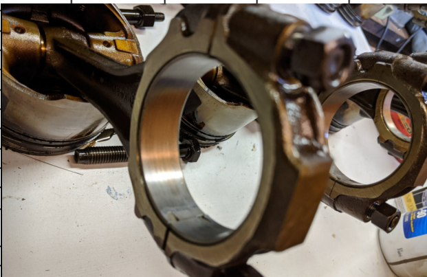
Bearings are made up of layers of metal. Often the outer layer is lead babbitt, with a bronze layer beneath that. In these three pictures you can see how the bearings have worn through the first layer and into the bronze underneath.

* THIS COLUMN APPLIES ONLY TO THE CURRENT SAMPLE