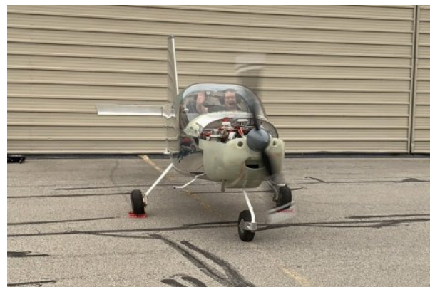
The first engine run!

We moved the project from the garage here at the lab to a hangar out at Fort Wayne International Airport in early July 2019. The days following the move were a time of excitement and hope, though that feeling wouldn't last. My wife and I have been working on this project since the summer of 2016 and we were both kind of getting burned out. However, actually being at the airport and talking with the other owners there helped keep our enthusiasm for the project going. In talking with the other homebuilt owners, it became apparent that even after it's flying, there is always something to work on, but we didn't worry about that much. We still had a lot of work to do just to get ours in the air. This was the part of the building process that's a running joke among homebuilders — 90% done, 90% left to go!