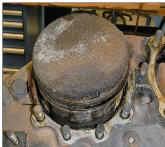
Piston pitting and erosion of the piston face

Normal combustion is an orderly, progressive burning of the fuel-air mixture in the cylinders. The gasses within the cylinders are ignited from the top. The flame then travels down in an organized