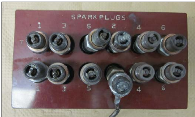
These cylinder #2 spark plugs are packed with melted piston material.

High heat is detrimental to piston engine operation. Its cumulative effects can lead to piston, ring, and cylinder head failure and place thermal stress on other operating components. Excessive cylinder head temperatures can lead to detonation, which in turn can cause catastrophic engine failure. Turbocharged engines are especially heat sensitive.