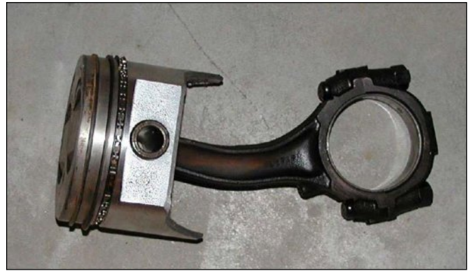
This bent connecting rod is from a car, but it's a good example of the damage pre-ignition and detonation can do.

also causes a reduction in power. Some engines can operate with mild detonation. However, severe detonation can cause engine failure in minutes. Because of the noise that it makes, detonation is called "engine knock" or "pinging" in cars.