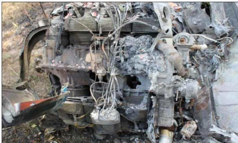
Bonanza end result

way. This combustive force, equally applied to the piston in a stable manner, pushes the piston down. The downward motion of the piston is then mechanically transferred to the propeller. This makes pilots very happy.